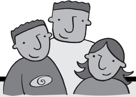
Table Talk helps children and adults explore the Bible together. Each day provides a short family Bible time which, with your own adaptation, could work for ages 4 to 12. It includes optional follow-on material which takes the passage further for older children. There are also suggestions for linking Table Talk with XTB children's notes.