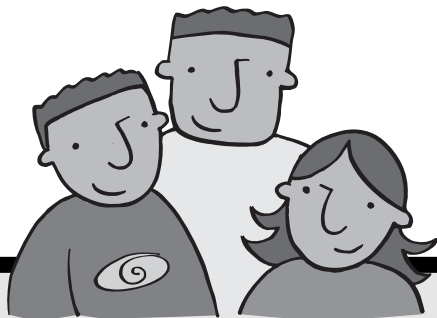
Table Talk helps children and adults explore the Bible together. Each day provides a short family Bible time which, with your own adaptation, could work for ages 4 to 12. It includes optional follow-on material which takes the passage further for older children. There are also suggestions for linking Table Talk with XTB children's notes.