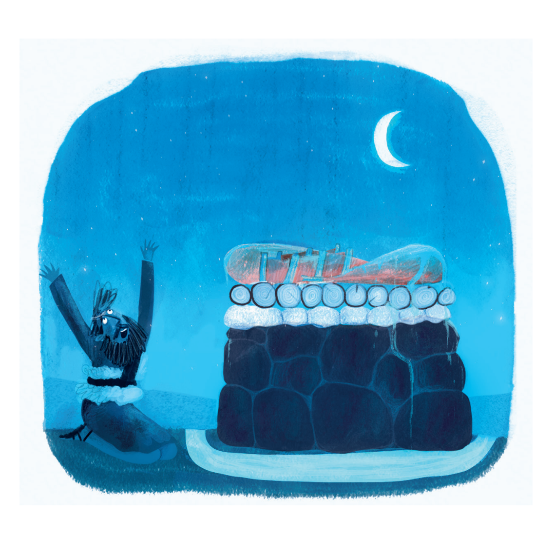
Then Elijah prayed...