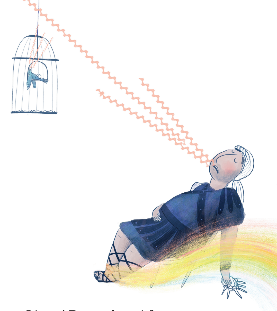
Listen! Do you hear it? Outside a prison, the jailer is snoring.