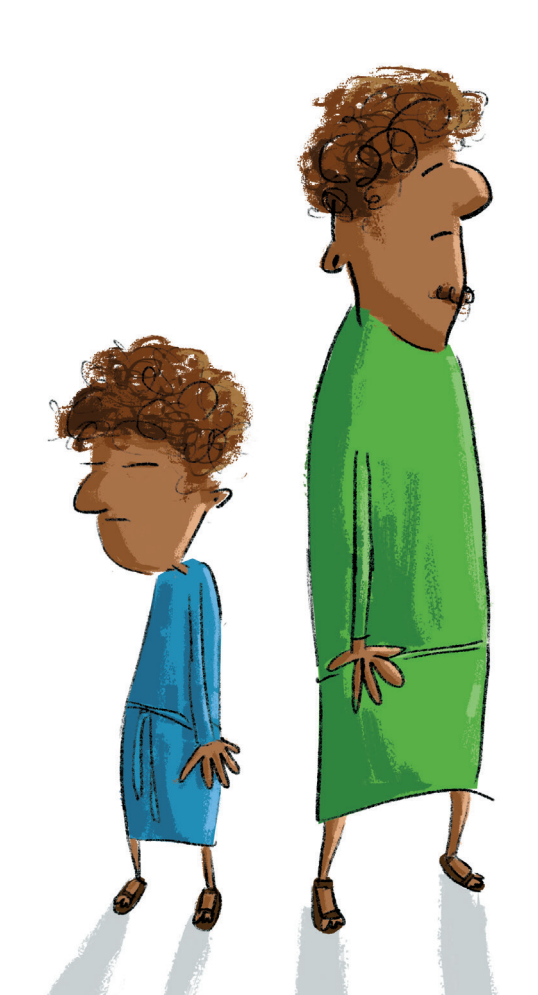
Once there were two brothers.