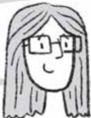
Kiara (age 13)

I love that God speaks to me in so many different ways through the Bible, even if I'm reading the same thing over and over again.